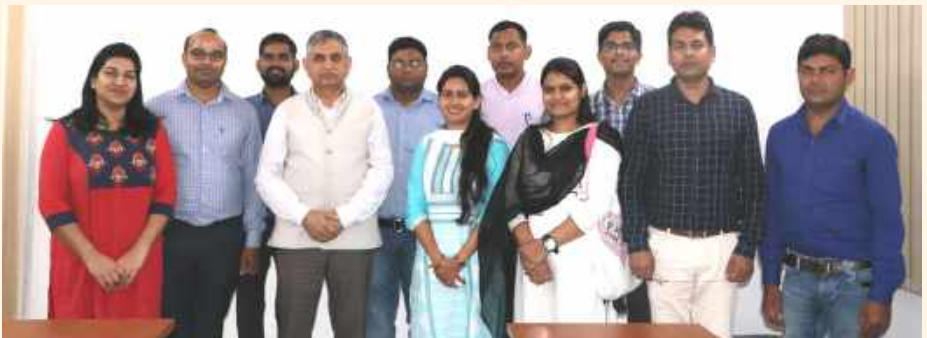
Newly appointed Asst. Professor with Hon'ble Vice Chancellor, BASU