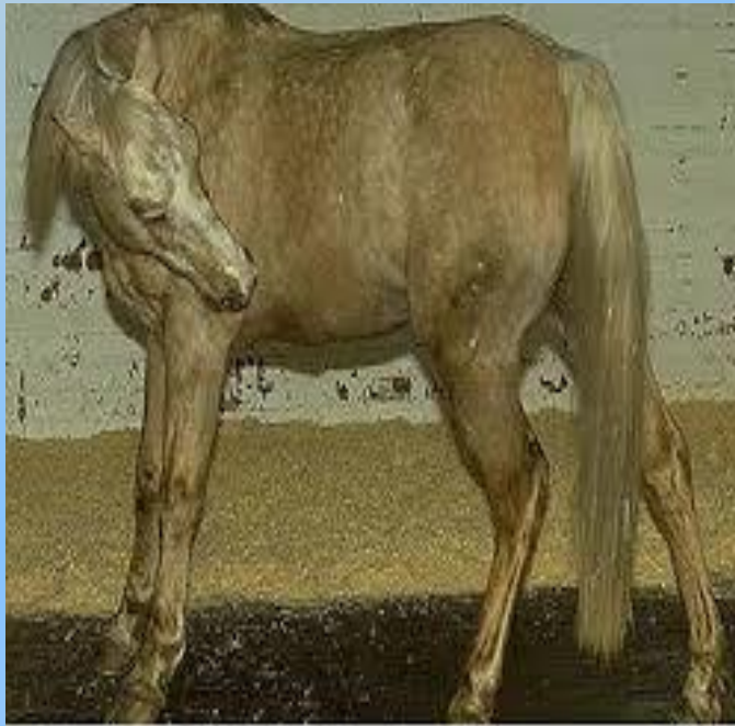
Flank watching is a sign of colic