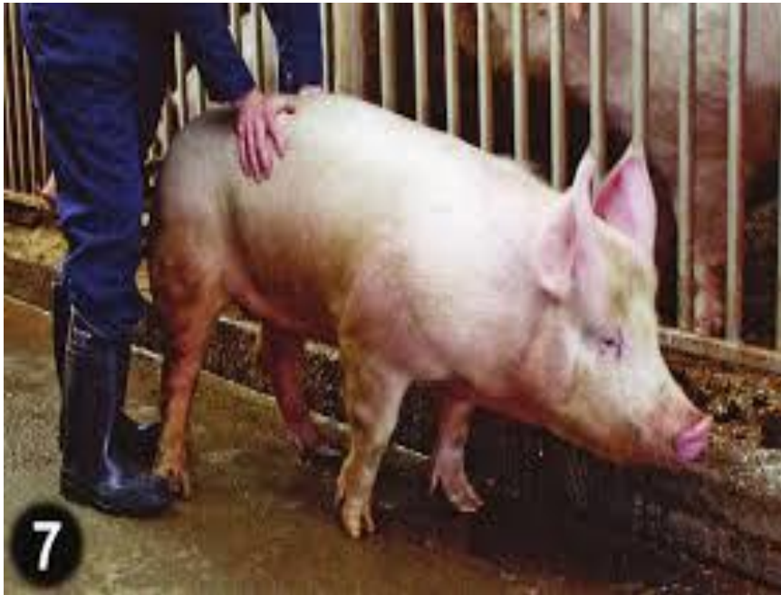
Back Pressure test