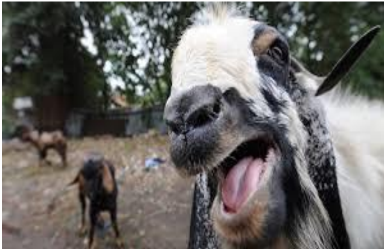
Bleating in goat