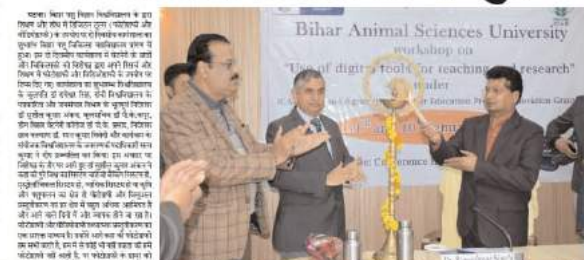
बिहार पशु विज्ञान विश्वविद्यालय में आयोजित फोटोग्राफी कार्यशाला का शुभारंभ।