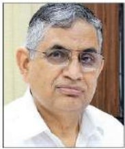
आयकर सेवा के तहत प्रसिद्धि मैगैजिन विभाग, राष्ट्रीय विभागा और पशु प्रशिक्षण विभाग से एक डॉक्यूमेंट मंडूट रहेगी। इस दौरे पर ओपेबी सेने को सेर राजा गया है।