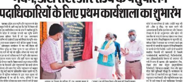
पशुपालन भवन, डाटा सेंटर और राज्य के पशुपालन पदाधिकारियों के लिए प्रथम कार्यशाला का शुभारंभ।